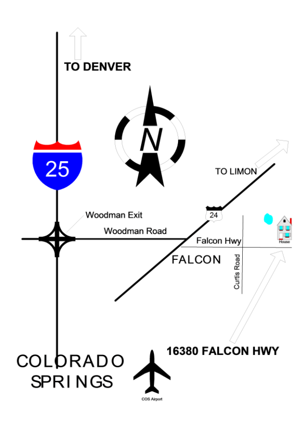
From I-25 North or South: Take Woodmen Road Exit and travel east to Highway 24. Turn Right on Highway 24 and then turn Left on Meridian. Go to stop sign and then Turn Left on Falcon Highway. Turn Left in driveway at 16380 Falcon Highway.